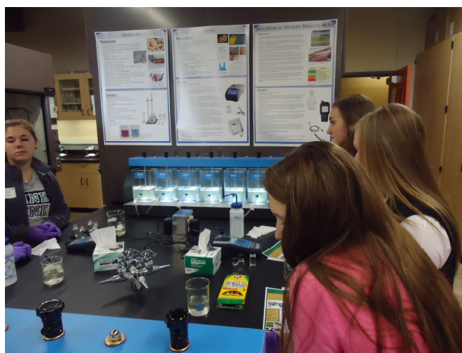
Water Quality Testing

The nine SUNY Canton hands-on workshops, including Lego Mindstorm Robots and robotic programming, graphic design and interactive art, computer-based automotive lessons, drinking water treatment, an introduction to surveying and electronics projects, gave girls the confidence to see themselves as the STEM workers of the future.